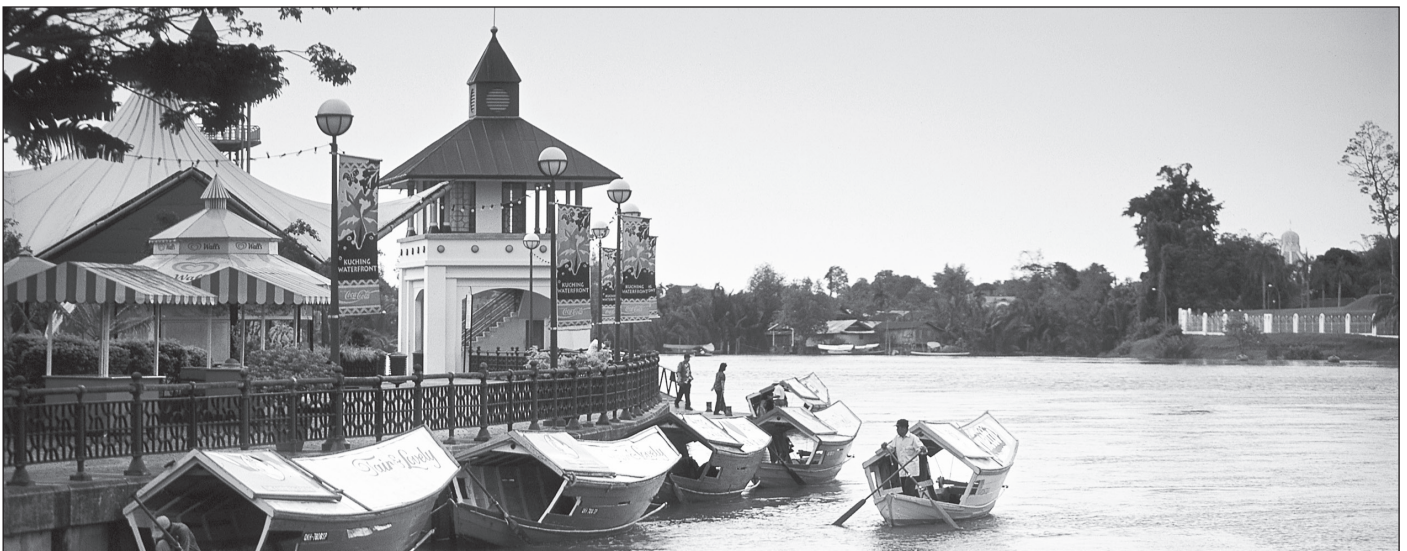
Kuching waterfront | Photo courtesy of Sarawak Tourism Board

This presentation is an autoethnographic observation on a fishing community near the Malaysian-Indonesian border, based on how the community is responding to tensions, particularly the environmental impacts that arise from the construction of access.